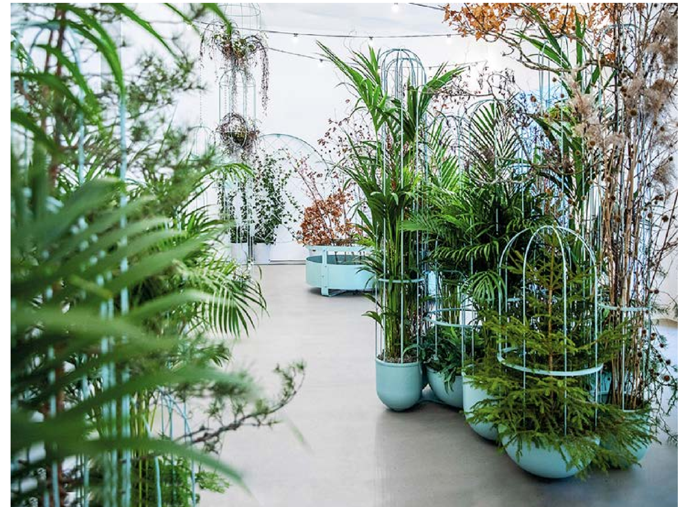
Previous page and this page: Cacti planter is for indoor use, and makes a nice additiuon to any office or lobby where you want to use plants as room dividers.