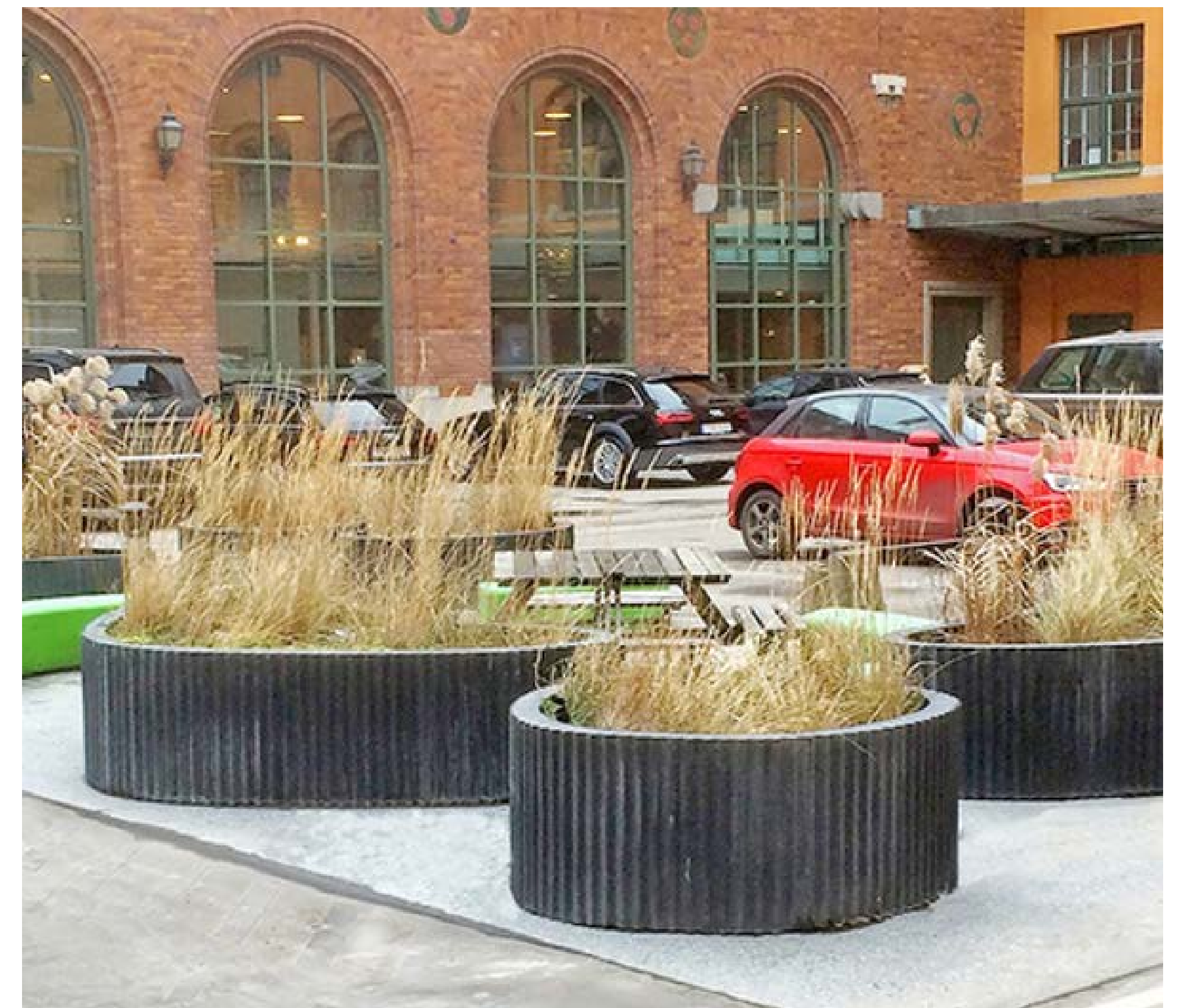
This page: Stensjökrukan's organic shape helps it to fit into many different kinds of environments.