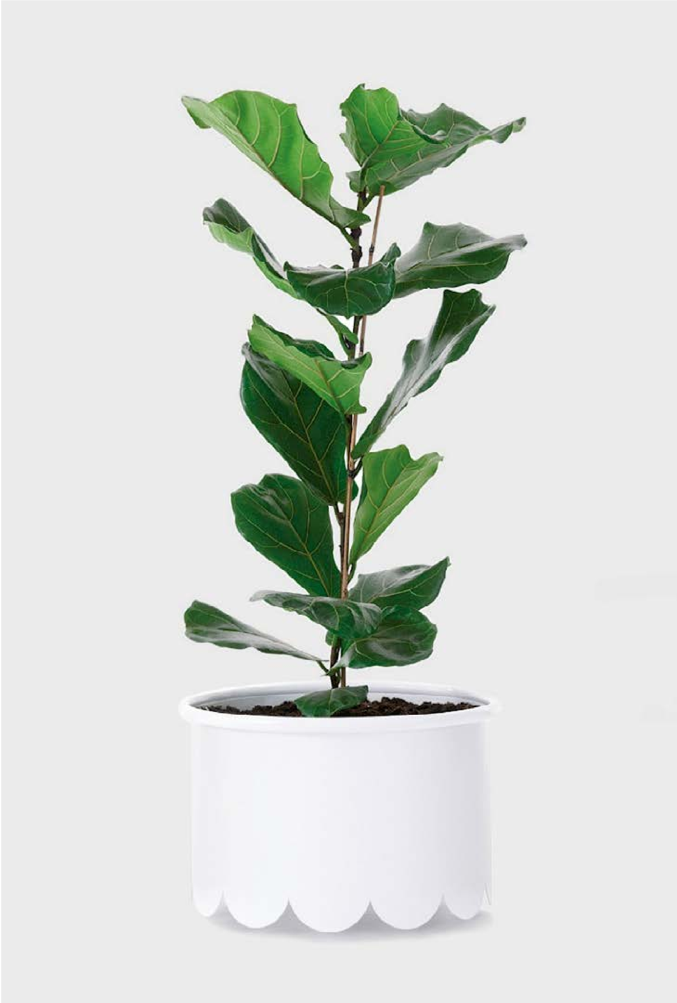
Below: Made for use indoors and outside, the planter is fitted with adjustable feet to compensate for uneven surfaces.