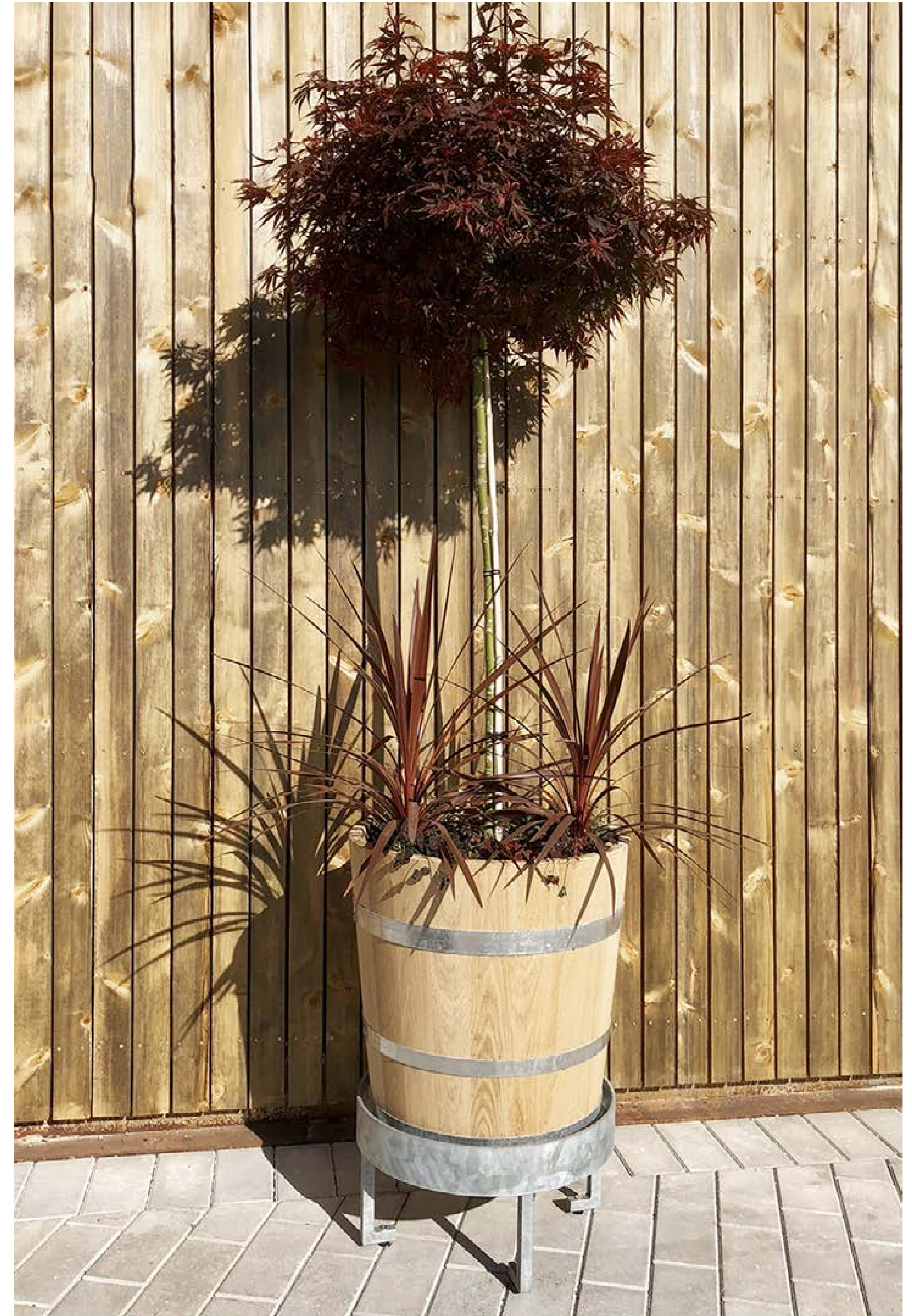
This page: Krokben is designed by one of Sweden's most acclaimed architects, Jonas Bohlin.