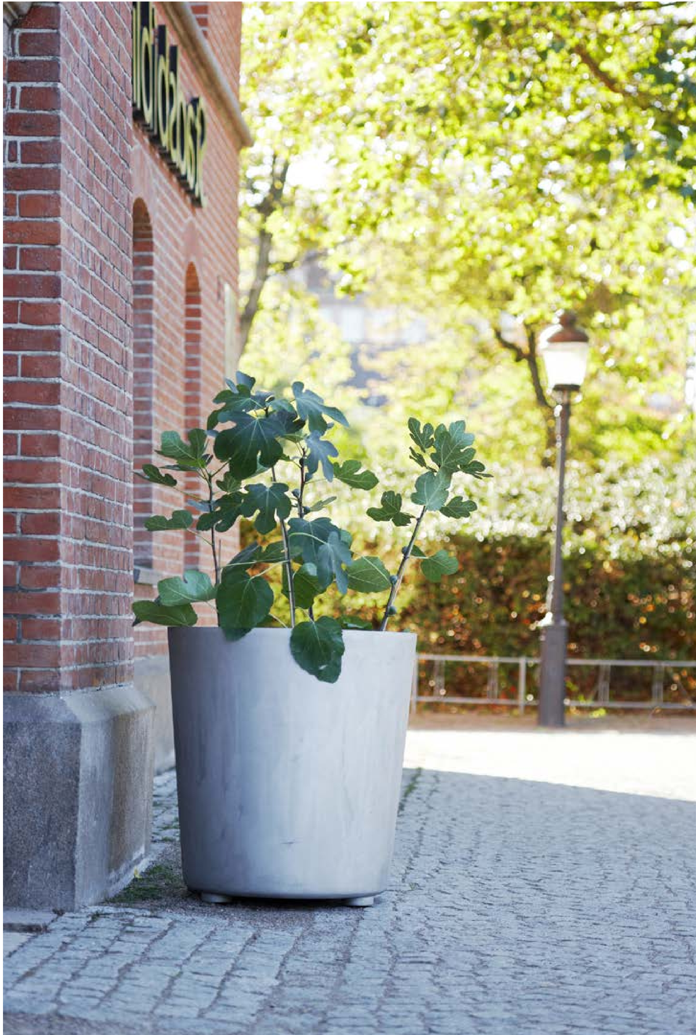
Left: Hinken is also available in sandcast aluminum. An environmentally friendly material that ages beautifully.